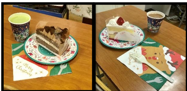
English Club Christmas Party 2020

Many people like to do things inside because it is cold in the winter. Many famous plays and ballets are popular during the Christmas season. Schools often have formal dances called Winter Balls and workplaces have holiday office parties . Party dresses with sparkles and fancy suits are popular. However, people also wear ' ugly Christmas sweaters ' for fun!