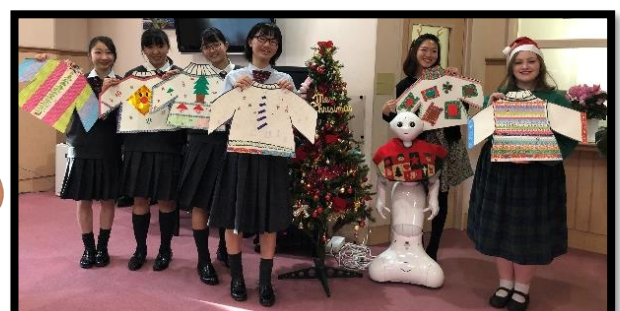
English Club 'Ugly Christmas Sweater' Party 2019