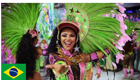
Carnival dancer in Brazil

In South America, the biggest Carnival parades are in Brazil . In fact, the Carnival in Rio de Janeiro is the biggest festival in the world! It is famous for Samba . Samba is a music and dance style from Brazil. Every year, the most famous Samba Schools in different cities pick a Samba Queen! Did you know that Tokyo has a Brazilian-style Carnival? It is in Asakusa every year. Brazil has the most people with Japanese roots outside of Japan. Many Brazilians also come to work in Japan. So, there is a long and strong friendship between Japan and Brazil.