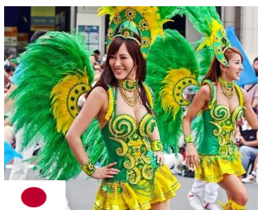
33 rd annual Asakusa Samba Carnival in Tokyo (August 23, 2014)