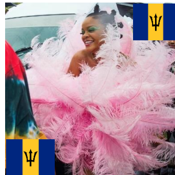
Rihanna in 2019

In South America, the biggest Carnival parades are in Brazil . In fact, the Carnival in Rio de Janeiro is the biggest festival in the world! It is famous for Samba . Samba is a music and dance style from Brazil. Every year, the most famous Samba Schools in different cities pick a Samba Queen! Did you know that Tokyo has a Brazilian-style Carnival? It is in Asakusa every year. Brazil has the most people with Japanese roots outside of Japan. Many Brazilians also come to work in Japan. So, there is a long and strong friendship between Japan and Brazil.