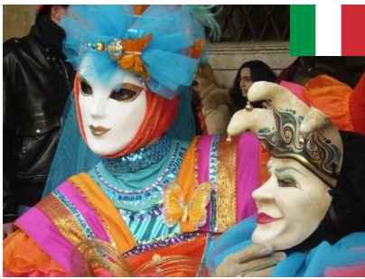
Carnival of Venice

Carnival started in old, Catholic Europe. The Carnival in Venice , Italy is especially famous for its masks . These are not Coronavirus masks but beautiful masks that keep your identity a secret. Let's dance at a masquerade ball! Carnival started in Italy then spread to France, Spain, Portugal , and other countries in Europe . The French, Spanish, and Portuguese brought the tradition to North America, Central America, and South America . Now, countries there celebrate Carnival a little differently because of their own culture .