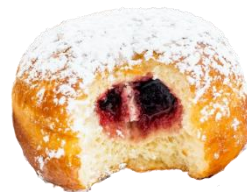
A Polish Paczki (Pączki) (ポンチキ)