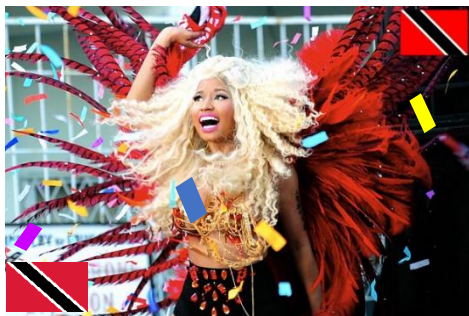
Nicki Minaj in 2012

Before, I said that North America was Canada, the U.S.A., and Mexico. But actually, the Caribbean islands are there too! Carnival is very famous there. It is loud, colorful, and full of energy . Women wear beautiful costumes with big feathers . Here are two famous Caribbean women! They are popular in the U.S.A. Rihanna (Robyn Rihanna Fenty) is an international pop star and CEO of Fenty Beauty. She was just named the 'National Hero of Barbados .' Did you know that Barbados became the world's newest republic in 2021? Nicki Minaj is an international pop star and rapper . She was born in Trinidad & Tobago but grew up in New York City. She is one of the biggest female rappers of all time.