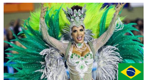
Carnival dancer in Brazil