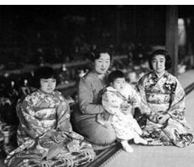
In 2022 Sheila sent this to the little girl in her old host family in Tokyo