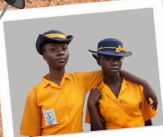
Makeni, Sierra Leone