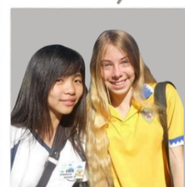
Taichung, Taiwan & Gold Coast, Australia