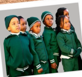
Houghton, South Africa, 2013