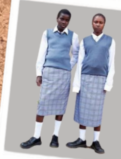
Kibera, Nairobi, Kenya