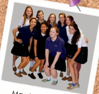
Maryland, U.S.A., 2012