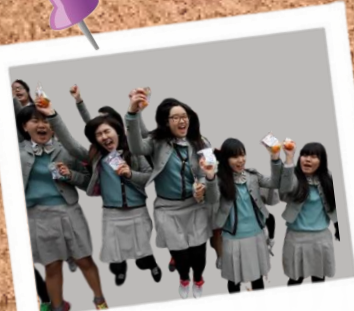
Seoul, South Korea