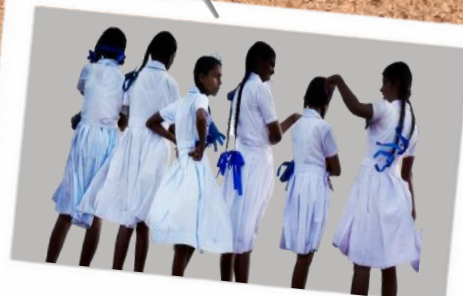
Galle Port, Sri Lanka