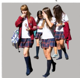
Castilla y León, Spain, 2012