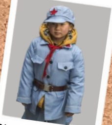
Sichuan, China, 2015